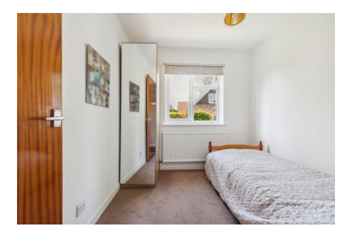
BEDROOM THREE double glazed window to rear, radiator.