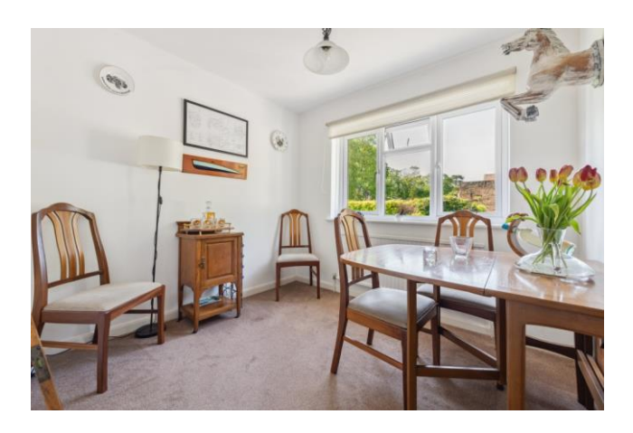
STUDY/DINING ROOM double glazed window to rear, radiator.

gas central heating boiler, space for fridge freezer, tiled floor, double glazed window to rear and double glazed door opening to the rear garden.