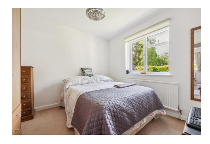
BEDROOM TWO double glazed window to rear, radiator.