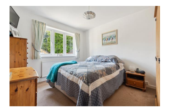
BEDROOM ONE double glazed window to front, radiator, television aerial point.