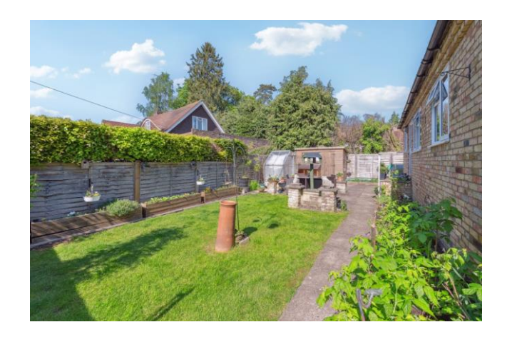
TO THE REAR is a level garden, partly laid to lawn and partly paved with mature borders and beds, timber framed shed with power and light, greenhouse, wall and timber fence surround with access to both sides.

TO THE FRONT is a sweeping gravelled carriage drive providing off street parking for several cars with timber gates at either end, area of paved patio and mature shrub borders and beds.